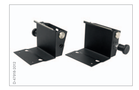
Wall mount Simple mounting option when fitted to a standard DIN rail.