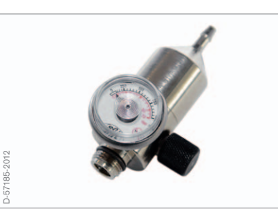
Pressure reducer For connection to the test gas cylinder.