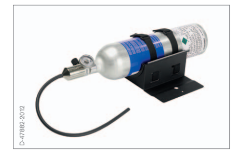
Test gas cylinder holder with test gas cylinder For securing the test gas cylinder to the X-dock Station.