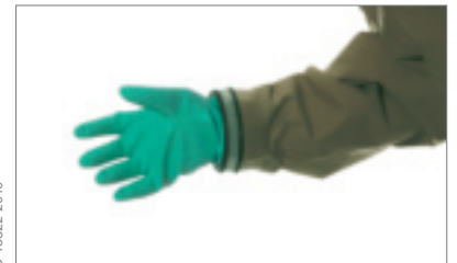
Previous EN combination