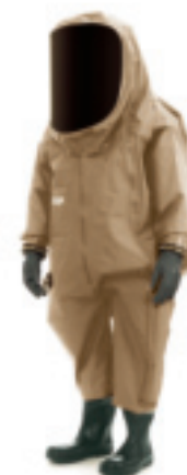
Dräger CPS 7900, olive