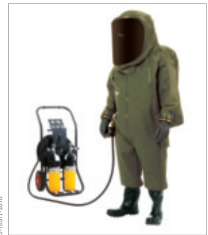
Dräger CPS 7900, olive with Dräger PAS AirPack I

This makes activities carried out in especially warm temperatures, e.g. surveying hazardous areas in hot climates, significantly less stressful for the cardiovascular system of the wearer. In addition, the system can also be used to have a fully equipped rescue team on stand-by without losing breathing air and with minimized thermal stresses.