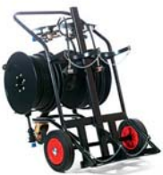
Dräger PAS AirPack 2: Extended duration breathing apparatus at its best.

For additional flexibility, the Dräger PAS AirPack 2 can be supplied with either one or two pressure regulators and two hose reels to allow joint use of the system, or for two completely independent systems to be run simultaneously.