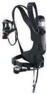
Dräger PAS Micro: A compact, back-mounted life saver.

Developed by Dräger to combine ergonomic design with comfort and ease of use.