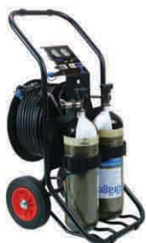
Dräger PAS AirPack 1: Extended duration breathing apparatus at its best.

Where the site has an installed supply of air, the Dräger AF1400 air filter unit can be used to provide clean air, free from dust and particles, with the Dräger PAS AirPack 1 acting as back-up.