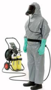
Dräger SPC 3800 Splash Protective Coverall

Light, comfortable, liquid-tight protection.