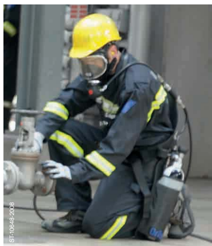
Dräger PAS Colt: This Hip-mounted breathing device is suited to short term operations.