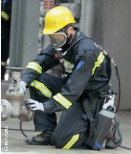
Dräger PAS Colt: This Hip-mounted breathing device is suited to short term operations.