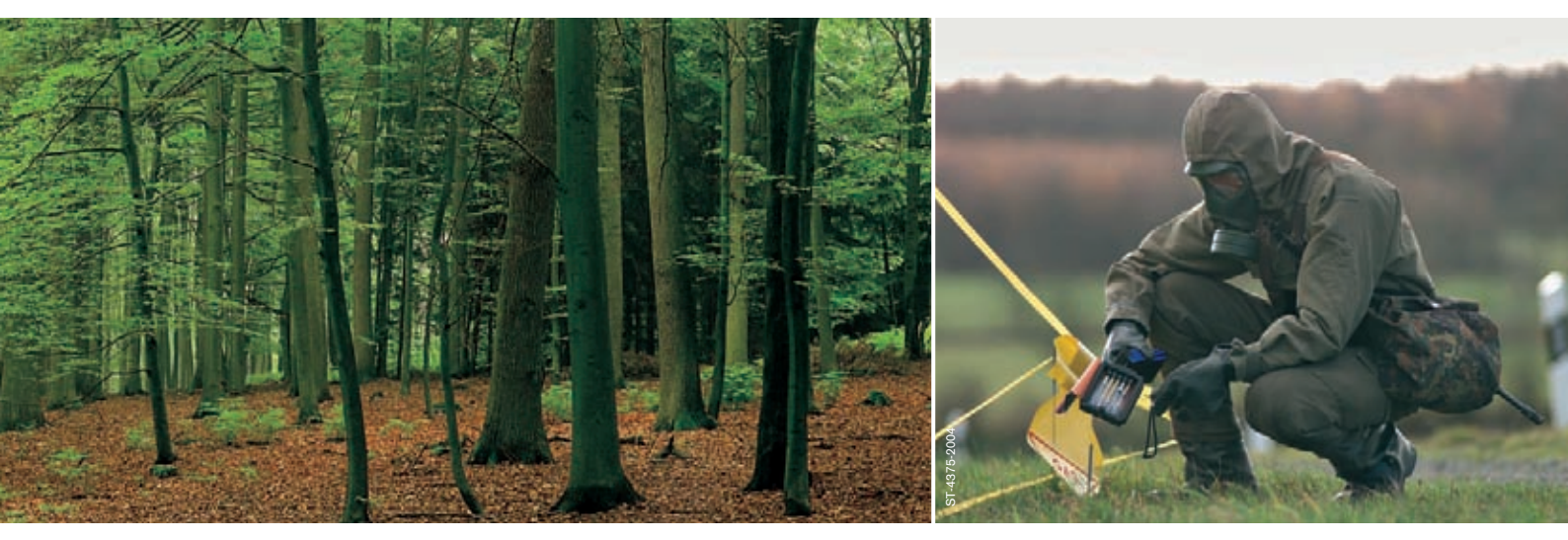
Some enemies are invisible. In such situations, the combination of detection and protection systems provides safety.

Who would have thought that the air we breathe, which is our most important asset, could potentially pose a serious threat? Such a threat can go completely unnoticed or often, this threat first becomes apparent after the air has been inhaled. That is why, when operating in environments where contamination is a constant threat, continuous respiratory protection is essential.