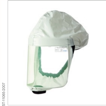
Dräger X-plore® short hood TH2, grey