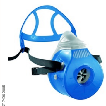
Dräger X-plore® 4740, TPE, M/L