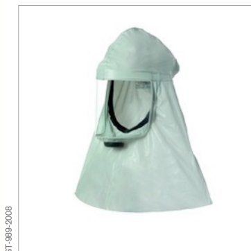
Dräger X-plore® long hood TH2, grey