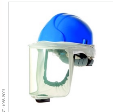
Dräger X-plore® safety helmet with visor