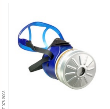
Dräger X-plore® 4740, silicone, S/M