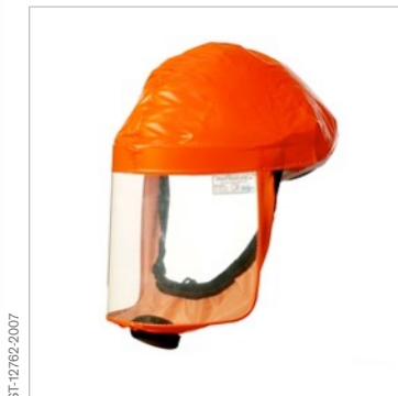
Dräger X-plore® short hood TH2, orange