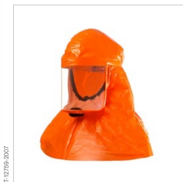
Dräger X-plore® long hood TH2, orange