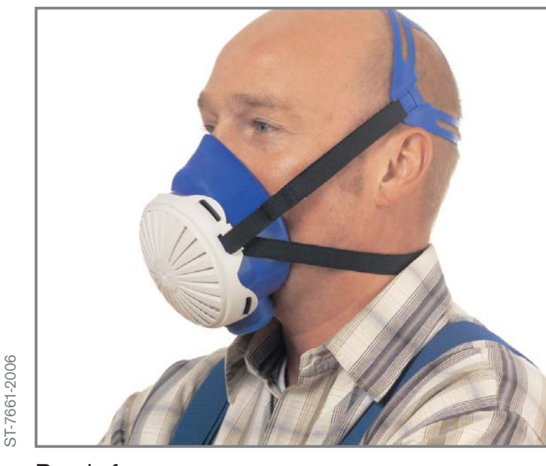
Ready for use.