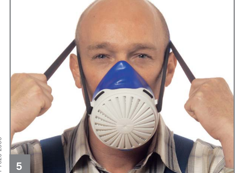
Pull the straps uniformily until the half-mask fits securely and comfortably against your face. If necessary readjust the straps.