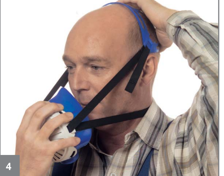
Position facepiece over the mouth and nose and position the head cradle on the head.n.

face-piece and adjust the straps or use a different size. Repeat test until a successful seal check is met.